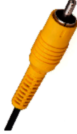
RCA composite video connector