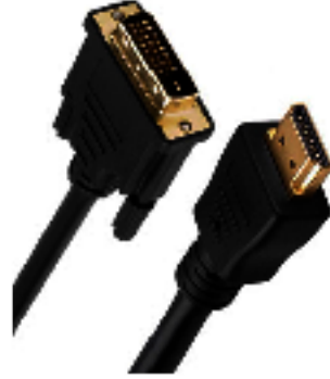
HDMI to DVI lead