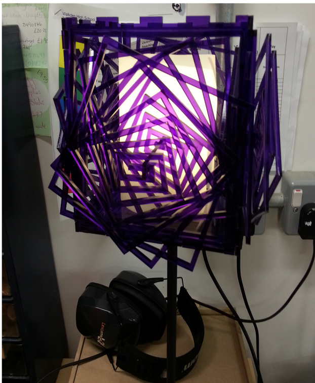
An alternative is to twist the spirals so they are 180 degrees opposed before locking in place with the central spacer. Tension in the acrylic material creates the spirals