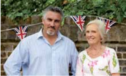
Paul Hollywood and Mary Berry

Baking is a great British tradition - it is relaxing, rewarding and great fun. When we were making the BBC Two series The Great British Bake Off , we tasted cake, bread and biscuits from all over the UK and were delighted to find that baking is more popular than ever.