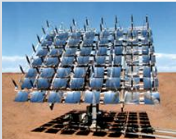
Figure 4. One of the most efficient PV panels in the world — this dual-axis PV tracking system uses small mirrors to focus sunlight on high-efficient cells. It supplies electricity to the Arizona Public Service grid.

It might not be obvious at first, but look closely at the bases supporting the panels. They are designed to move! SunPower Corporation, a German