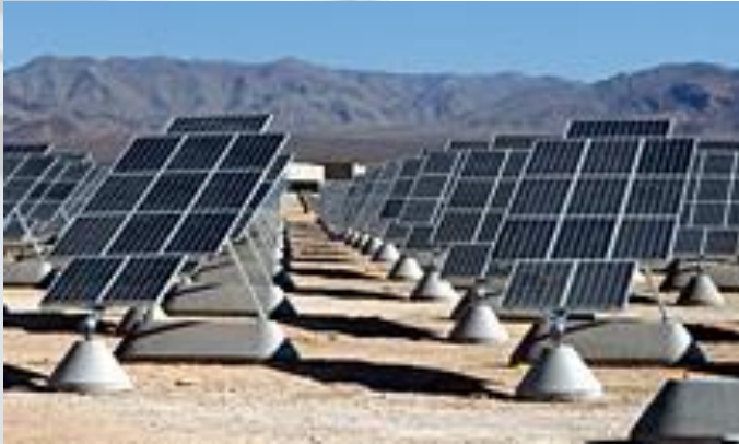
Figure 1. The solar power array at Nellis Air Force Base in Nevada.

The angle between a photovoltaic (PV) panel and the sun affects the efficiency of the panel. That is why many solar angles are used in PV power calculations, and solar tracking systems improve the efficiency of PV panels by following the sun through the sky.