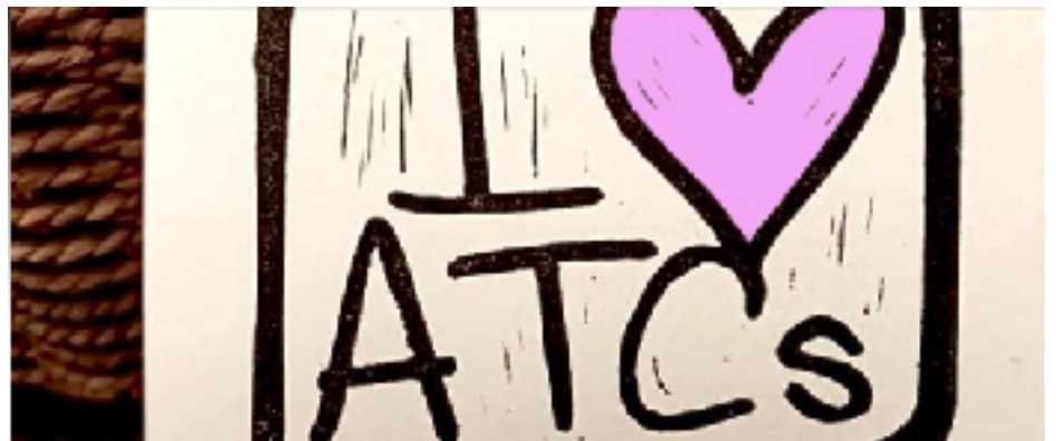
ATC Artist Trading Cards

Most ATC trading occurs online. There are groups on Facebook and MeWe. Some people trade on Instagram.