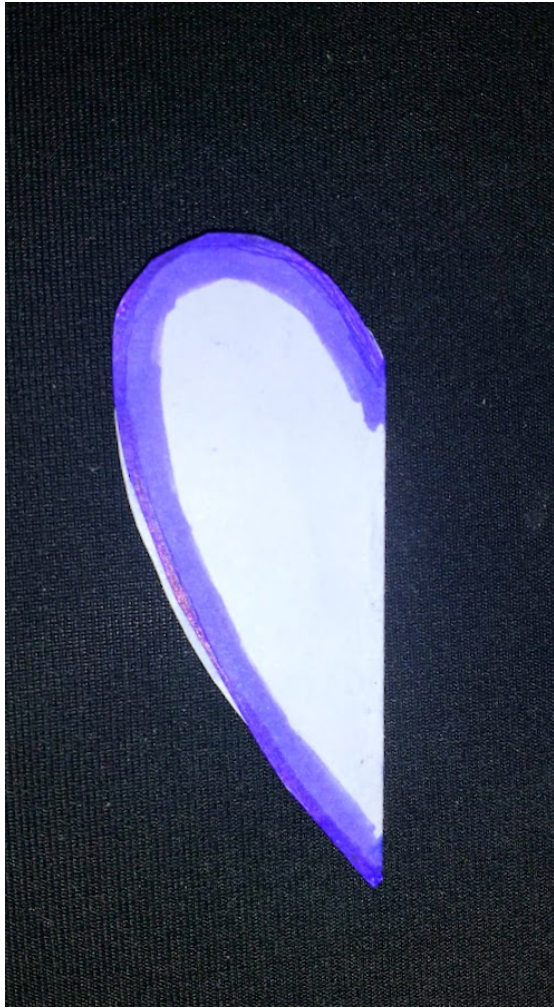
Left side of folded heart showing overlap along middle area

3) Go over the edge with a wide tipped marker and then fold the heart along its length