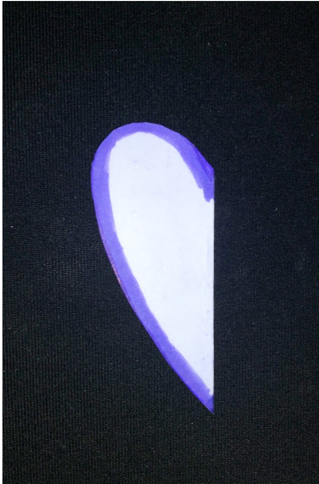
5) Left view of folded heart with overlap trimmed away

4) Trim away the overlap that is visible on both halves