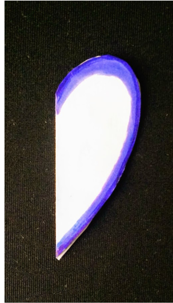
Right side of folded heart showing overlap towards bottom