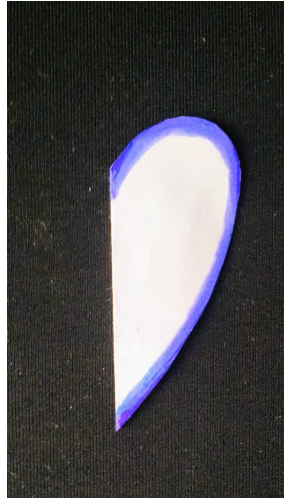
6) Right view of folded heart with overlap trimmed away