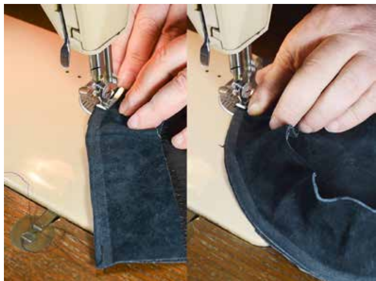
Pic 05 Sewing the gusset

Sew the gusset to the front and back pieces with the Outsides facing in!