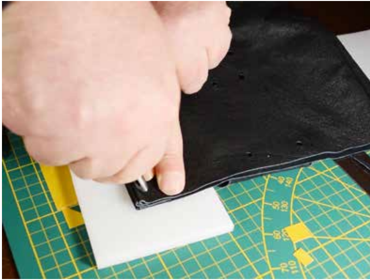
Pic 06 Punching the holes

punch 16 holes equally spaced around the top of your poch. Take care not to punch through the seams.