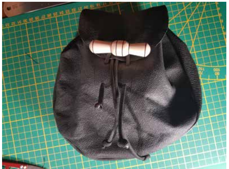
Pic 07 The finished sporran

After inserting the cords find a decorative button and sew it to the top. I turned it on my lathe, same should work with a piece of antlers.