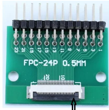
Pin 1 on the right AliExpress FPC Adapter Board

To avoid confusion, cover the silkscreen numbers on the AliExpress adapter board with masking tape and use a pen to write the new numbers as shown below: