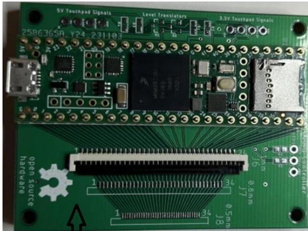
Pin 1 on the Left Teensy 4.1 FPC Connector Board (from step 4 in Instructable)

The location of pin 1 on the FPC connector is not consistent in the electronics industry. Sometimes it's on the left side and sometimes on the right side. I've even seen PC motherboards that silkscreen a 1 on the left side for some FPC connectors and on the right side for other FPC connectors. For my FPC connector boards, I chose to put pin 1 on the left (see the silkscreen "1" on lower left picture). My software expects FPC pin 1 to be wired to Teensy I/O 23. Unfortunately the popular FPC adapter boards available on AliExpress have silkscreen markings that define pin 1 on the right (see silkscreen on lower right picture).