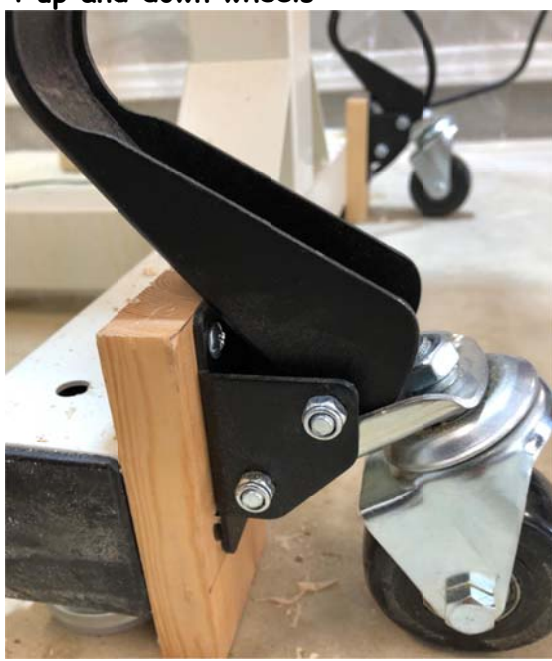
4 up and down wheels

Since the holes on the Jet lathe and casters do not line up I had to enlarge the holes on the lathe legs.