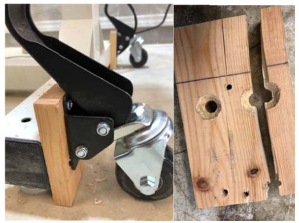
With wood brace