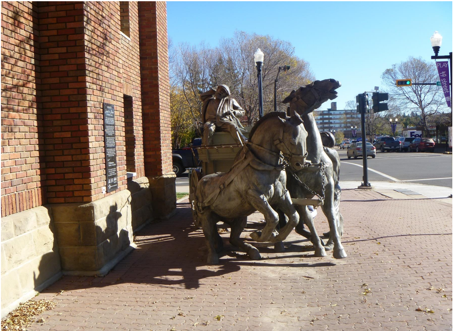
Sounds the Alarm