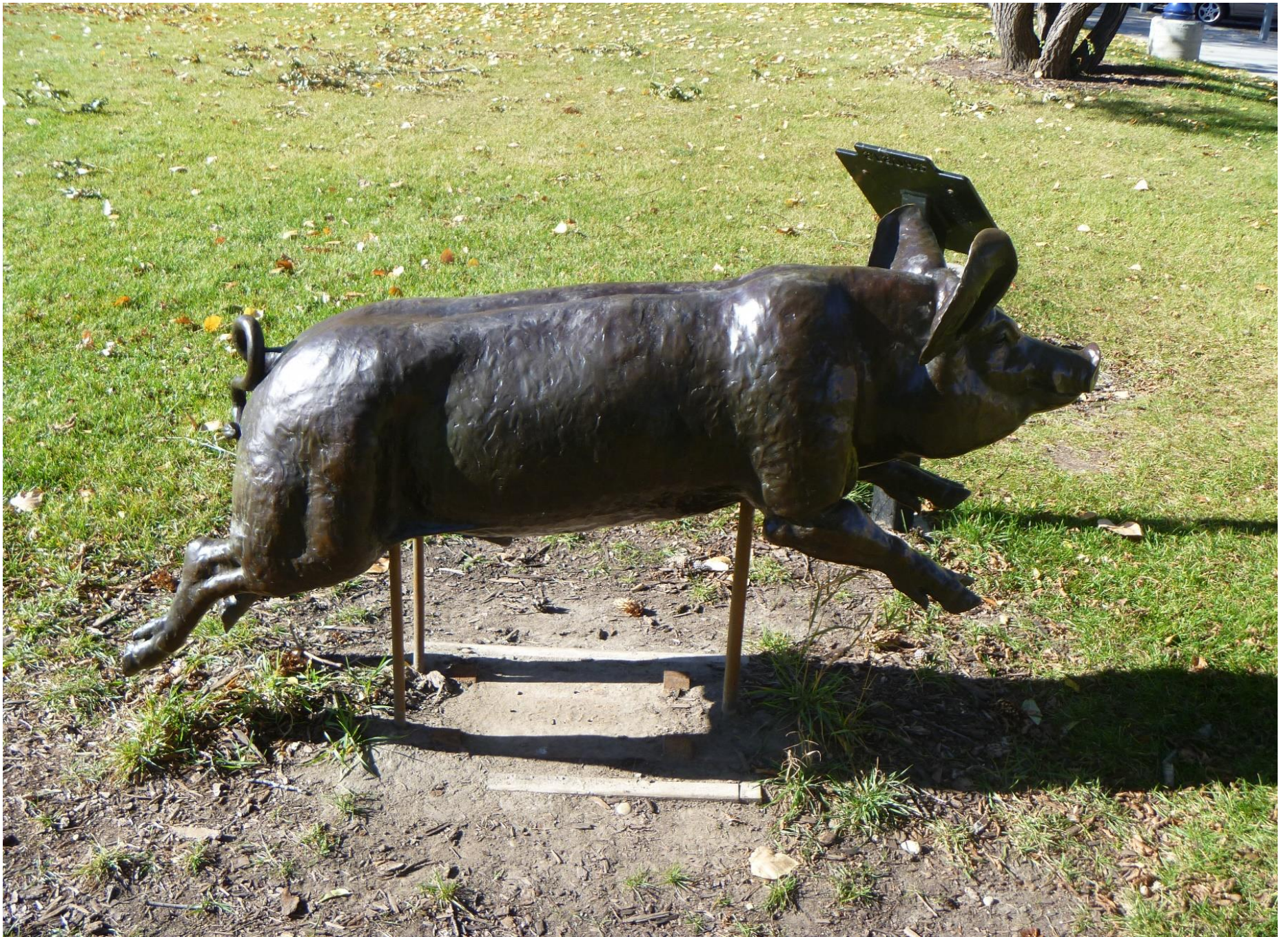
Francis the Pig