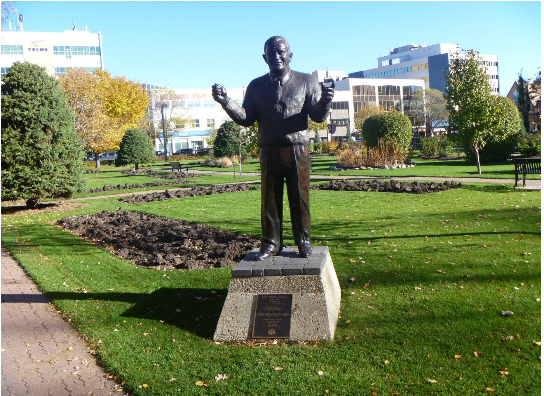
Let the Music Play