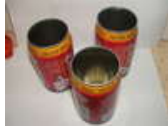
Drinking Glasses from Cans by magiccowy