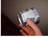
Soda Can Flyer by rogers236