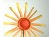
No-Weld Versatile Decorative Flower Made from an Aluminum Can by AngryRedhead