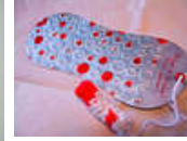
Bookmarker: Blood Is Thicker Than Water (Photos) by sparkleponytx