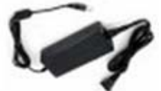
FP DC 12V 5A