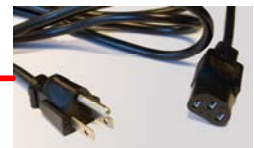
AC 110V power cord