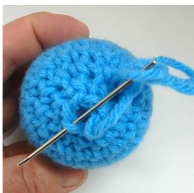
Figure 2: To close hole on back of head, loop needle and end tail of yarn through front loops of last six stitches.

R13: *Sc in next sc, dec*, rep 6 times. (12 sts)