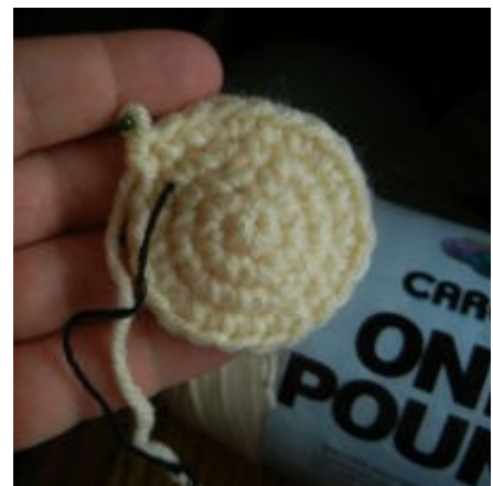
Figure 1: Example of rounds worked in spirals, with contrasting yarn to mark end of previous round.