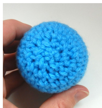
Figure 3: Pull end of yarn snug to cinch hole closed, then make an overhand knot and hide tail inside.

Insert 9mm black eye posts between rows 6 and 7, aligned on opposite sides of head. Keep in mind that the first round should be the front, or nose. When you are satisfied with the spacing of eyes, push safety backings on eye posts.