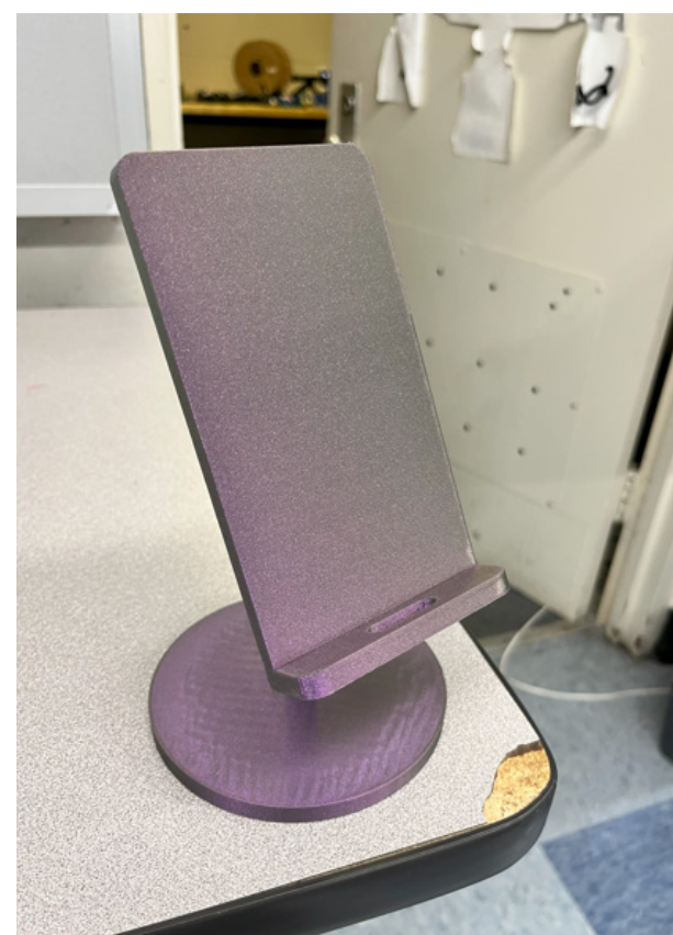
2nd FINAL Prototype